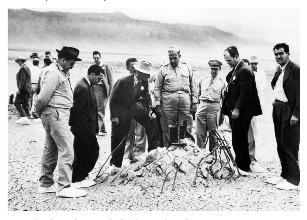
That is the next ridiculous photo we find. Here is the subtext:

The reason they are telling you this B-17 was a drone is so you don't ask questions about that stupid filter. If they admitted the plane was manned, you might start to ask how radioactivity can be filtered in a cockpit like that. The short answer is, it can't. Radioactivity is very small ions, like alphas and betas. Betas are high energy electrons. Electrons are tiny, and cannot be filtered by screens. Neither can photons. The cockpit would have to be completely shielded all around. Shielded, not filtered. But if it is shielded, it can't be flown, since the shields would prevent all visibility. So the story fails both ways.