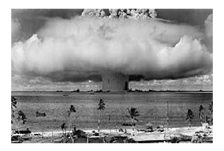
What a difference 3 kt makes, eh?

That's the Trinity photo again. So many things wrong there. To start with, the explosion is pretty pathetic compared the way they faked the later ones. Trinity was about 20kt, while Able and Baker in the Bikini Atoll were only slightly bigger at 23kt. And yet Baker is faked to look like this.