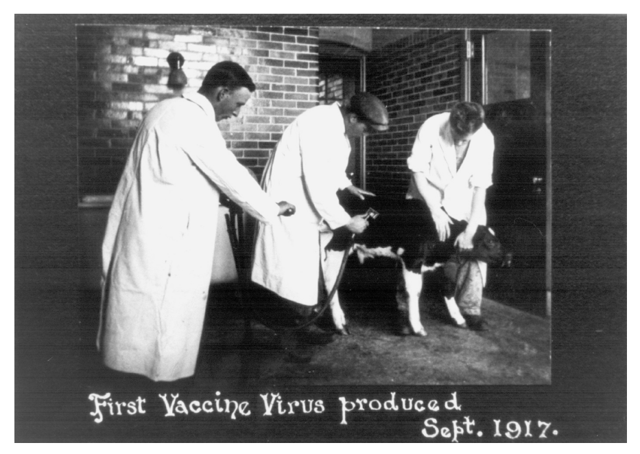
Figure 13.2 After packaging bulk smallpox vaccine imported from the New York City Health Department Laboratories for about a year, Connaught Laboratories began to fully prepare its own smallpox vaccine in September 1917. The first step in the production process was shaving and preparing the calf for inoculation.

Figure 13.1 Connaught Laboratories' first smallpox vaccine production facility was located in several isolated rooms at the south-east corner of this building (the front corner at the left end of the image). Main laboratory building, c. 1917-18, Connaught Antitoxin Laboratories, Farm Section, University of Toronto.