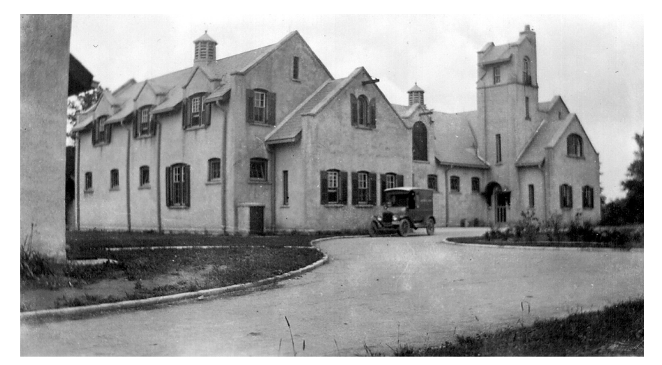
Figure 13.1 Connaught Laboratories' first smallpox vaccine production facility was located in several isolated rooms at the south-east corner of this building (the front corner at the left end of the image). Main laboratory building, c. 1917-18, Connaught Antitoxin Laboratories, Farm Section, University of Toronto.