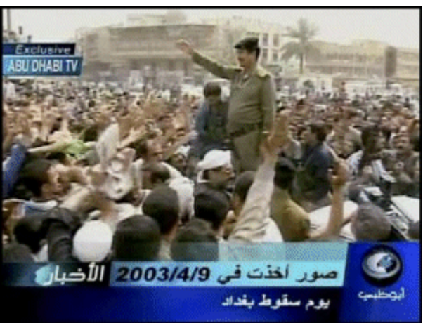
US Marine tear down statue of Saddam Hussein in Paradise Square, Baghdad, at 1130 hrs on 9 April 2003. Four hours after this American public relations spectacular, the real Saddam Hussein appears less than six miles north of Paradise Square, mobbed by armed supporters!

In a move once that once again reinforces the accuracy of the original Operation Shekhinah intelligence, George Dubya Bush has demanded four "key" airfields for an ongoing "strategic alliance with the new Government of Iraq." To say this is premature would be seriously understating the case. As of yesterday, American forces had actual physical control of less than three-percent of sovereign Iraq.