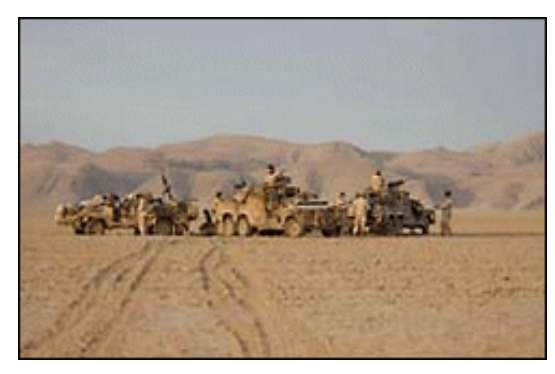
On 21 March 2003, the British and Australian Special Air Services Regiments [SAS] were unwittingly tasked with protecting "Israeli Assets" H2 and H3 in Iraq's Western Desert. Their British and Australian political masters stood these elite troops into clear and present danger, without ever explaining the real reason for their presence.

When Part One of Operation Shekhinah was first published in January 2002, it was viewed by many as a work of complete fiction. "Where is the proof," my mainly Jewish critics asked, "that Israel intends to illegally invade Iraq and steal its strategic oil reserves?"